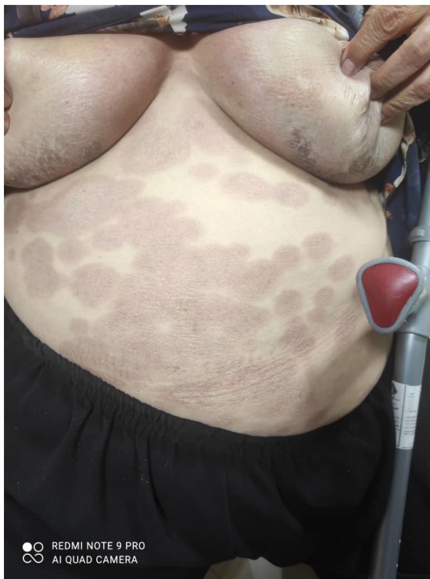
Figure 2. Multiple erythematous-violaceous and sclerotic lesions developed a few days after getting the first dose of AstraZeneca SARS-CoV-2 vaccine.