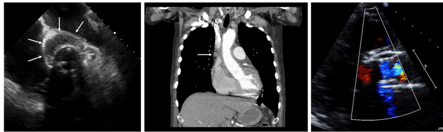
Figure 2A. TEE showing aortic root abscess (white arrow marks).