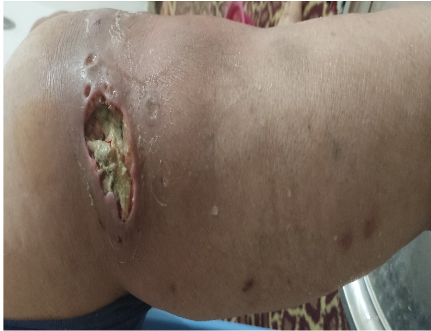
Figure 1 . A mucopurulen painful and ulcerated lesion of right sided foot with irregular borders compatible with pyoderma gangrenosum.

The authors declare that they have no competing interests.