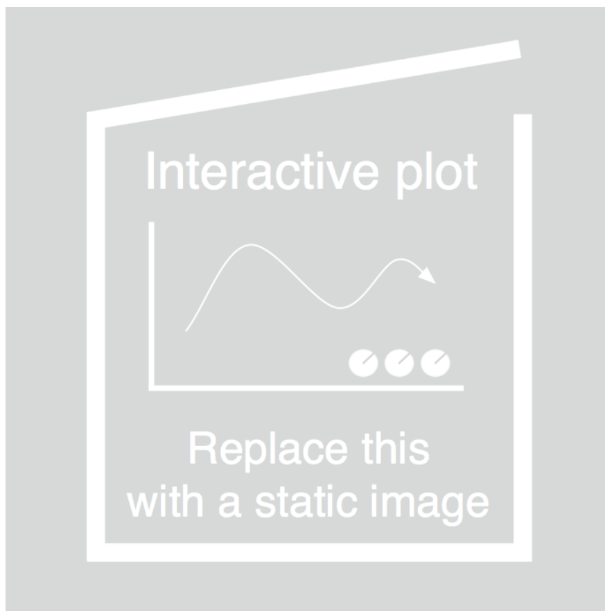
Figure 1: An interactive figure created using 3dmol.js. Move the figure and zoom in and out.